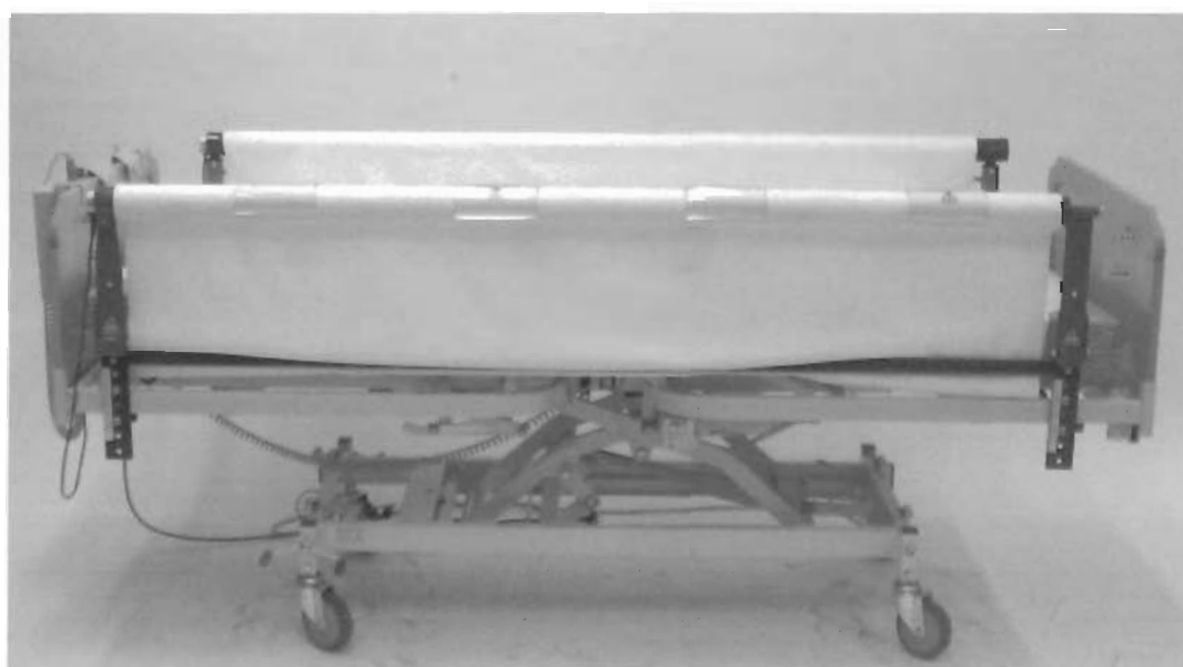
VENDLET HC-2 turning sheet.

According to the manufacturer the product may be used by persons up to 200 kg.