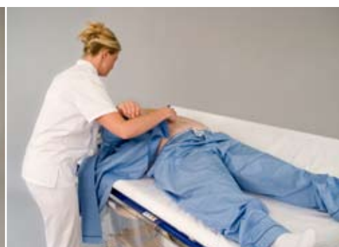
Washing and changing