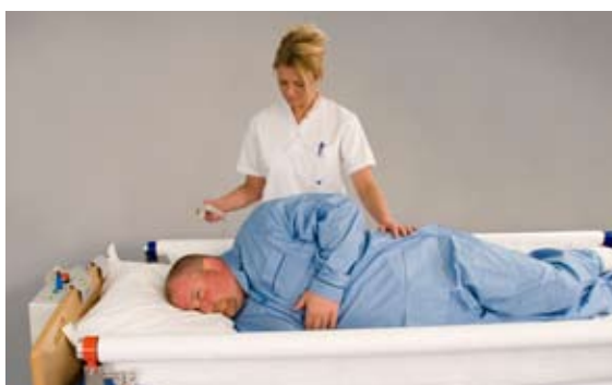
Turning and repositioning

The continuous turning sheet is rolled onto two motorised bars, one on each side of the bed. The bars revolve when activated by the hand control. As the turning sheet tightens firmly on the bar, the patient is repositioned or turned.