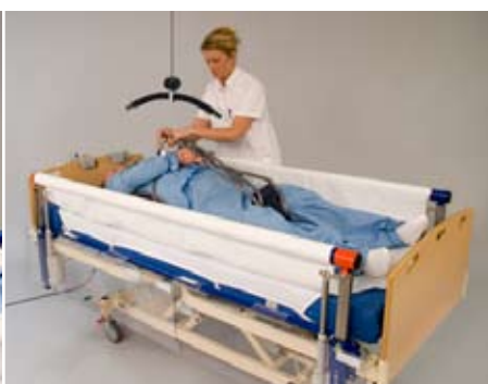
Using a lifting sling